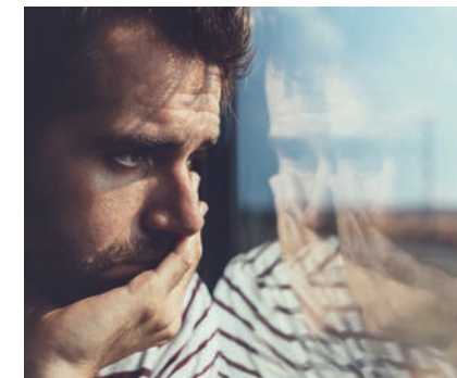
Usually for one person the loss cycle begins, there are 5 stages;

Coming to terms with losing someone who you thought you would be with forever, is one of the most difficult journeys a parent can take.